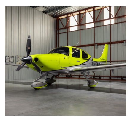
CIRRUS SR22T G6

$399 / Hour Member Rate (Dry) $449 / Hour Standard Rate (Dry)