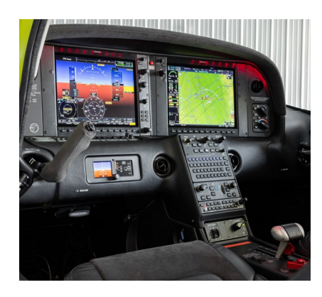
PRIVATE PILOT: 8-10 WEEKS

$5,500 applied to client account balance (Free $500 credit)