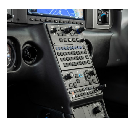
COMMERCIAL: 2-3 WEEKS

$1,600 applied to client account balance (Free $100 credit)