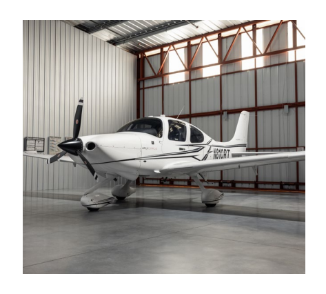
CIRRUS SR20 G6 N79KW / N810RT

$269 / Hour Member Rate (Dry) $299 / Hour Standard Rate (Dry)