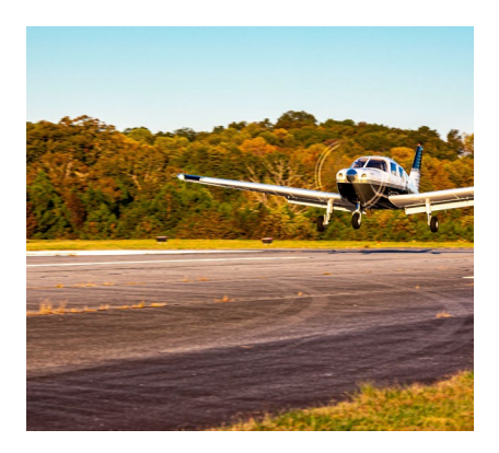
PIPER DISCOVERY FLIGHT

Dedicated instructor from start to finish $12,000 in a Piper Archer II $18,000 in a Cirrus SR20 G6