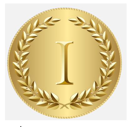
$5,000 BLOCK PURCHASE

$249 / Month. Unlocks member rates. Also includes two hours free simulator time and access to all ground seminars.