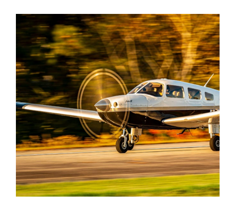
PIPER ARCHER II N6861F / N8903C / N8397L

$449 / Hour Member Rate (Dry) $499 / Hour Standard Rate (Dry)