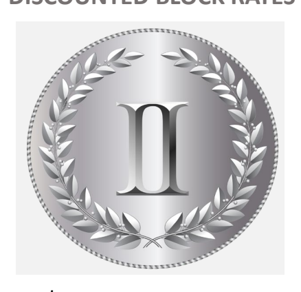
$3,000 BLOCK PURCHASE

$3,250 applied to client account balance (Free $250 credit)