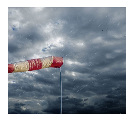
INSTRUMENT: 6-8 WEEKS

Dedicated instructor from start to finish $12,000 in a Piper Archer II $18,000 in a Cirrus SR20 G6