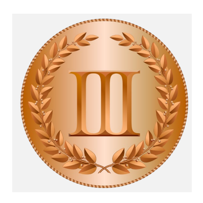
$1,500 BLOCK PURCHASE

$199. Assume command of a glass cockpit Piper Archer II during a scenic flight around Los Angeles.